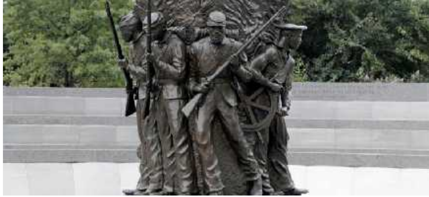
Photo and information from https://washington.org/find-dc-listings/african-american-civil-war-memorial

The African American Civil War Memorial is located at 1925 Vermont Ave., NW, Washington, D.C. The wall around this memorial lists the names of the USCT troops. The museum across the street commemorates the African American Civil War soldiers.