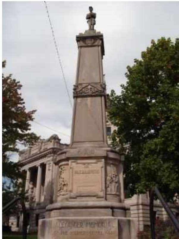
G.A.R. Soldiers of All Wars Memorial, located on the southeast corner of the Monroe County Courthouse in Bloomington, Indiana, was erected in 1928 by the G.A.R., Paul E. Slocumb Post No. 85 to honor soldiers from the Mexican War, Civil War, Spanish-American War, World War I, and all wars.