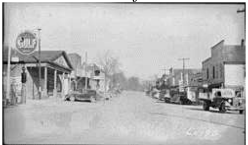
Kuttawa\ in\ 1939