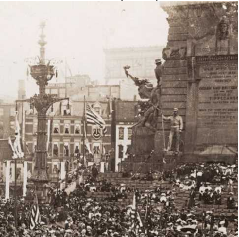
Dedication of the Soldiers' and Sailors' Monument, 1902.