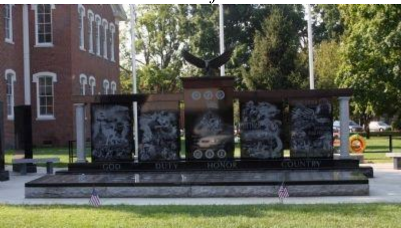
Photo and information from http://www.hmdb.org/marker.asp?marker=22525

Scott County War Memorial is dedicated to all Scott County veterans who served during war and conflict. It is located on the northwest lawn of the Scott County Courthouse in Scottsburg.