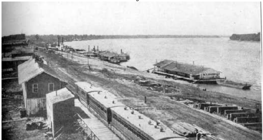
Photo and information from "Cairo, Illinois." <u>http://www.angelfire.com/wi/wisconsin42nd/cairo.html</u> accessed 29 April 2015.

Cairo, Illinois was surrounded by water on two sides. It became a huge military camp. Fremont "established a naval base on the Ohio River side of Cairo. It consisted of mainly of the floating wharfboats... simply flatboat hulls covered with shed-like structures....It was here the gunboats from Carondelet and Mound City were fitted out with crews and ordnance."