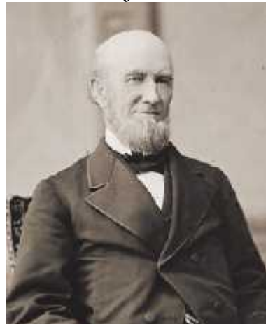
Photo and information from "Building a Brown Water Navy." Hallowed Ground Magazine, Winter 2011. Civil War Trust. <u>http://www.civilwar.org/hallowed-ground-magazine/winter-2011/building-a-brown-water-navy.html</u> accessed 29 April 2015.

James B. Eads, a St. Louis engineer wrote to Gideon Welles, "suggesting specifications for retrofitting snagboats, a type of steamer typically used to clear river obstructions, to serve as gunboats in shallower, narrower river waters." Welles sent his letters to the War Department for the Army, who commissioned Eads to build them. He built the first seven of these gunboats in less than three months.