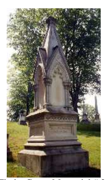
Photographs and information from Find a Grave Memorial # 20359

William Pitt Fessenden was born October 16, 1806 in Boscawen, New Hampshire. He served in the U.S. Congress (1841-1843), the U.S. Senate (1853-1864; 1865-1869), and helped organize the Republican Party. He greatly influenced the Union finances for the war as Chairman of the Senate Finance Committee and as Secretary of the Treasury (July 1864 – March 1865). He died September 8, 1869 and lies buried in Evergreen Cemetery in Portland, Maine.