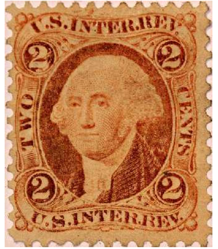
George Washington Tax Stamp

Paying for the Civil War: Taxes, Internal Revenue, and Enrolled Agents