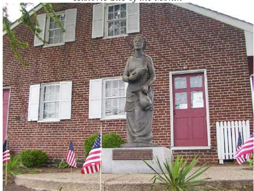
Information from "Jennie Wade House." Gettysburg Tour Center. Accessed April 28, 2016. http://www.gettysburgbattlefieldtours.com/gettysburg-tours/jennie-wade-house

The Jennie Wade House is located at 548 Baltimore Street in Gettysburg. Tours begin every thirty minutes in peak season and last thirty minutes. In the spring and fall, tours last forty-five minutes. Admission is adults $8, children (6-12) $5, children (5 and under) free.