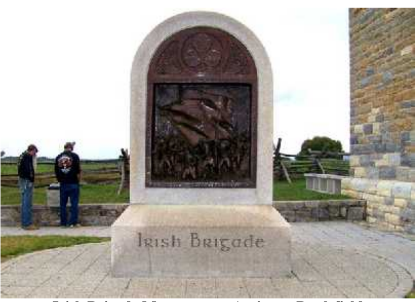
Irish Brigade Monument at Antietam Battlefield