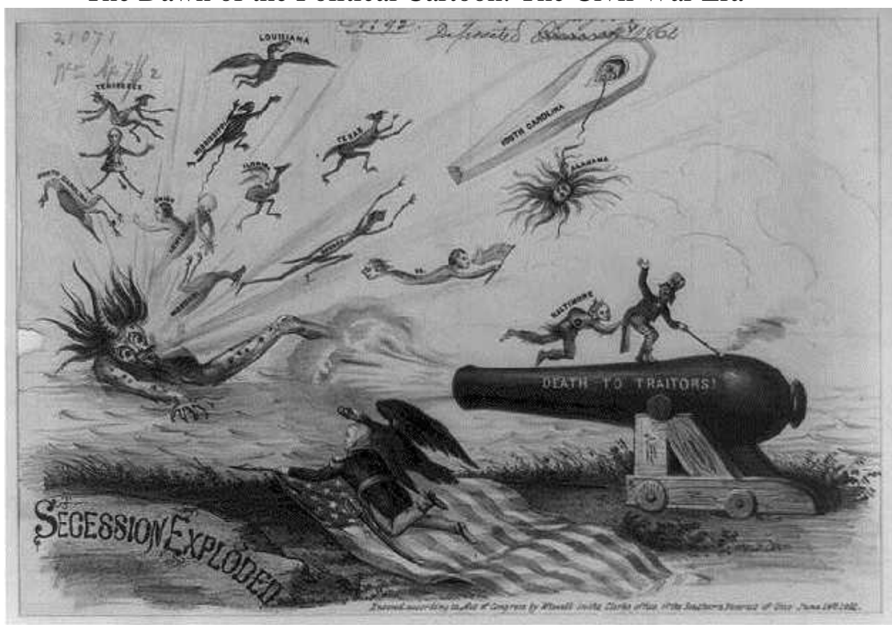
Library of Congress

Though commonplace in newspapers and magazines today, political cartoons were relatively new during the mid-nineteenth century. This talk explores popular views of the American Civil War and surrounding incidents as expressed through political cartoons of the time. Presented through power point and featuring visual images of select political cartoons from a variety of Civil War era publications.