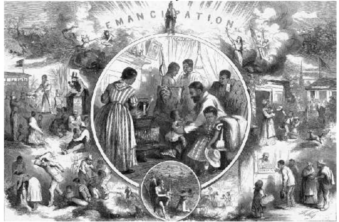
\label{lem:photo} Photo \ and \ information \ from: \ \underline{https://www.gilderlehrman.org/programs-exhibitions/looking-lincoln-political-cartoons-from-civil-war-era.}

Looking at Lincoln: Political Cartoons from the Civil War Era: This traveling exhibition "explores the Civil War and issues of slavery through political cartoons. These originally appeared in newspapers and were sold individually as prints in shops, on street corners, and by mail. Artists and citizens who created these images lived in a century in which racism was deeply ingrained in American life. Even ardent abolitionists who fought to end slavery often took little account of its implication for race relations." Educators can request this exhibition of four interlocking panels for four weeks from the Gilder Lehrman Institute of American History. For more information, please visit <a href="https://www.gilderlehrman.org/programs-exhibitions/looking-lincoln-political-cartoons-from-civil-war-era">https://www.gilderlehrman.org/programs-exhibitions/looking-lincoln-political-cartoons-from-civil-war-era</a>.