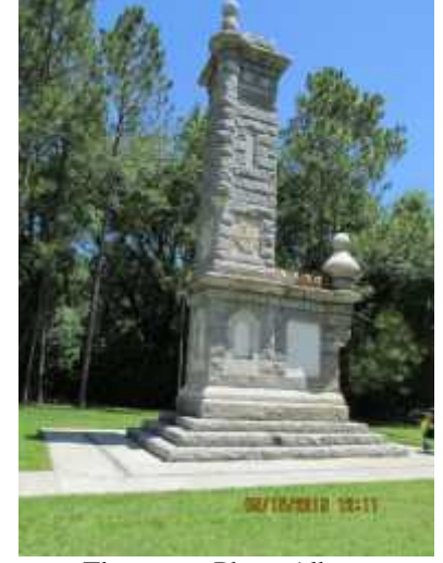
Thompson Photo Album