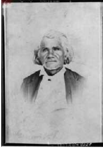
Soldier of the Month