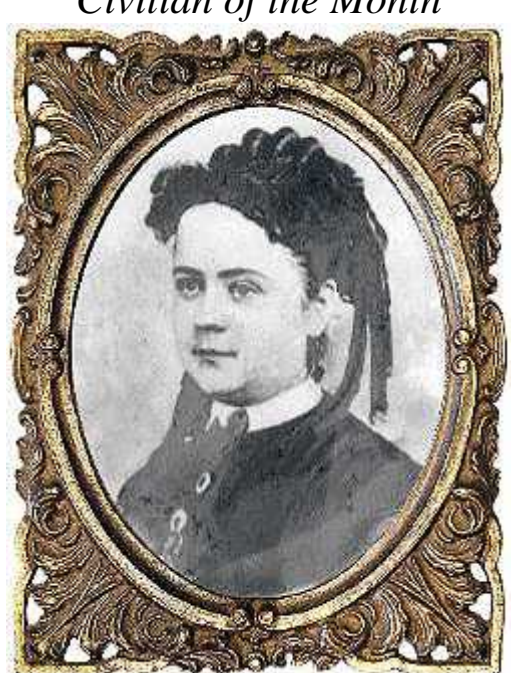
Civilian of the Month

Correspondence of the Chicago Post , March 2, 1862: "The evacuation of Nashville by the rebel forces and its occupation by National troops is no longer a matter of conjecture....The rebel army has departed, and about one-half the inhabitants had followed their example. Most of the business houses were closed, only a clerk or porter being left to look after the goods, wares and merchandise. The chief reason of this exodus of the business population is presumed to have been an apprehension of their inability to get away when once our army should be in possession. The oath of allegiance, which would restore them to the condition of good and loyal citizens of the republic, contains a clause to the effect that they have not furnished material aid to the rebellion. Probably very few could take such an oath." ("The Occupation of Nashville")