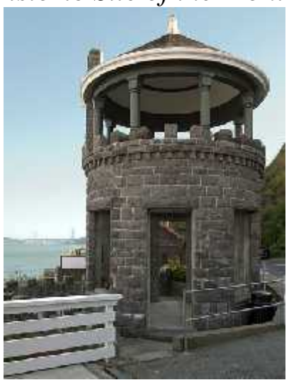
Historic Site of the Month

Photo and information from www.noehill.com/marin/nat1976000497.asp