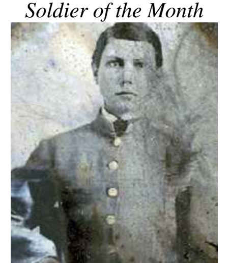
Photo and information from <a href="http://www.civilwar.org/hallowed-ground-magazine/summer-2010/and-may-god-forgive-me.html">http://www.civilwar.org/hallowed-ground-magazine/summer-2010/and-may-god-forgive-me.html</a> and Find a Grave