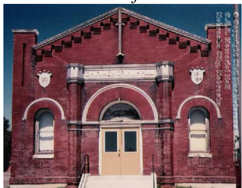
Photo and information from <a href="http://civilwarmuseumnc.org/index.html">http://civilwarmuseumnc.org/index.html</a>

The Civil War Veterans Museum at the GAR Memorial Hall: "At one time, there were more than one hundred Grand Army of the Republic Halls in Nebraska. Only four remain today. The Nebraska City GAR Hall, built in 1894, is the only one of these halls in the state that has undergone restoration and development as a Civil War and GAR museum. In addition, it is the largest Civil War Museum in the Midwest. The Hall is a reminder to us and our children of the presence of Civil War veterans in Nebraska City and the role they played in the growth of the community, state and nation after the war. Dedicated to the memory of the Union and Confederate veterans, the Hall is being maintained so that it may once again serve the community as a meeting place, research library and historical museum." It is located at 910 First Corso, across from the library in Nebraska City. It is open from noon to 4 p.m. every Friday, Saturday and Sunday from the last weekend in April through the end of October. Visit <a href="http://civilwarmuseumnc.org/index.html">http://civilwarmuseumnc.org/index.html</a> to see pictures of the interior of the hall.