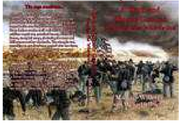
The saga continues...

<u>Perryville, Kentucky, October 8, 1862.</u> The small town of just under 400 residents has the notable distinction of unwittingly hosting the largest battle ever fought in the State of Kentucky. From before sunrise until well after dark, 70,000 soldiers waged war, smashed homes, dismantled fences, trampled crops, shattering the trees and killing one another wholesale. The struggle was, according to one Southern general who was there, "...the severest and most desperately contested engagement to my knowledge." The reader witnesses this historic carnage through the eyes of eleven different protagonists, both Northern and Southern, both infamous and common. From Brigadier General Phil Sheridan to Private George Kilpatrick and from Brigadier General Pat Cleburne to Private Sam Watkins, the Battle of Perryville is revealed and revered in this strikingly particular fictional narrative.