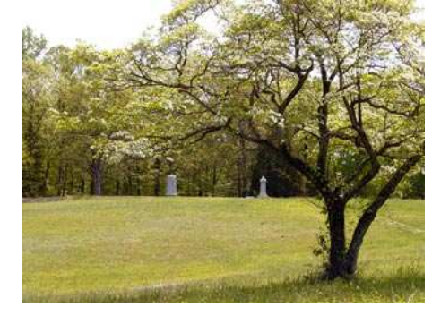
Bloody Angle at Spotsylvania

battlefields, consisting of 16 stops, begins at Fredericksburg Battlefield Visitor Center on U.S. 1, Lafayette Blvd. Walking trails are available at each battlefield. The grounds are open dawn to dusk daily, except for New Year's Day, Thanksgiving and Christmas Day. Building hours vary from season to season. Entrance to the parks are free. There is a fee to view each 22 minute movie at Fredericksburg and Chancellorsville ($2, age 10-61; $1, over 61, free, children under 19 and school groups through 12<sup>th</sup> grade).