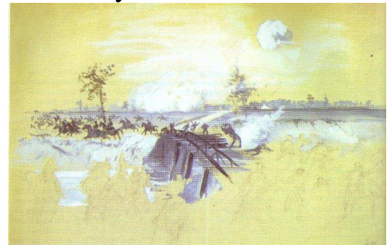
Unfinished sketch of Reed's bridge from The Fight for Chattanooga: Chickamauga to Missionary Ridge , by Jerry Korn

When one thinks of the Battle of Chickamauga, attention is always focused on September 19 and 20, 1863, the two principle days of the action. What has almost been forgotten are the critical events and actions that took place on September 18<sup>th</sup> that set the stage for everything that took place over the next two days. My presentation will center on the events of September 18<sup>th</sup>. We will look in detail at the positions of the two armies and the confusion of the command structures of the Army of the Cumberland and the Army of the Tennessee. I will center my presentation on the critical events that took place at the fords and bridges over the Chickamauga Creek. We will look, in detail, at the actions of the Union brigades under the command of Colonels Robert Minty and John Wilder and their attempt to defend the fords and bridges against advancing Confederate forces. The program will pay special attention to the brigade of mounted infantry under the command of John Wilder. In particular, his attached battery commanded by Captain Eli Lilly.