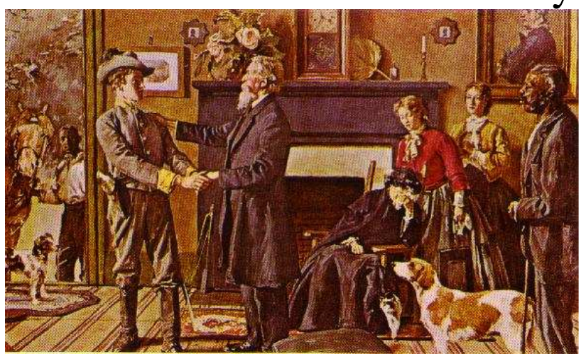
"Leaving Home" by Gilbert Gaul

Torn apart by sectionalist sympathies, the elite women of border state Kentucky faced the hardships of lost loved ones, battles waged on the front steps of their homes, and the uncertainty of life caught between two warring visions of the future, North and South. Often neglected by historians, the diaries, letters, and reminiscences of these women bring to life the divisive nature of the war within their state. Kentucky women struggled to find where they fit in the design of the rapidly evolving state and tried to reconcile this with their vision for their country. Our discussion will reveal the complexity of Kentucky women's sectional allegiances and the ways in which these women responded to and affected the course of the war.