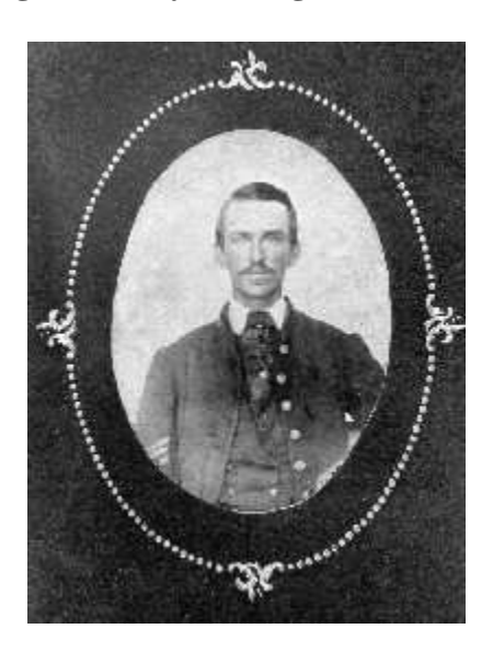
\frac{Photo\ from}{http://ehistory.osu.edu/uscw/features/regimental/south\ Carolina/Confederate/KershawsBrigade/Kirkland.cfm}

Copied from Civil War Tours.net April 2008 newsletter