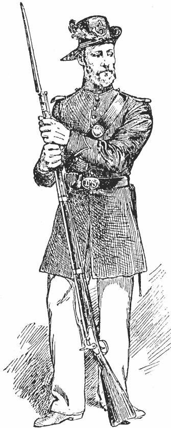
UNIFORM OF THE UNITED STATES REGULARS IN 1861.

Visit the website of The Indianapolis Civil War Round Table: http://indianapoliscwrt.org/