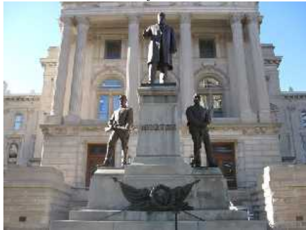
information from www.civilwarhome.com/mortonbio.htm

Oliver Hazard Perry Throck Morton was Indiana's governor during the Civil War. "He answered Lincoln's call for troops by raising twice the number requested for Federal service. Certain the war would be brief, he labored to keep in uniform every Indianan who volunteered, so that none would be prevented from serving when the War Department began refusing troops it was unprepared to feed and equip. Largely because of his efforts to encourage volunteerism, Indiana provided 150,000 enlistments to the Federal army with little resort to the draft."