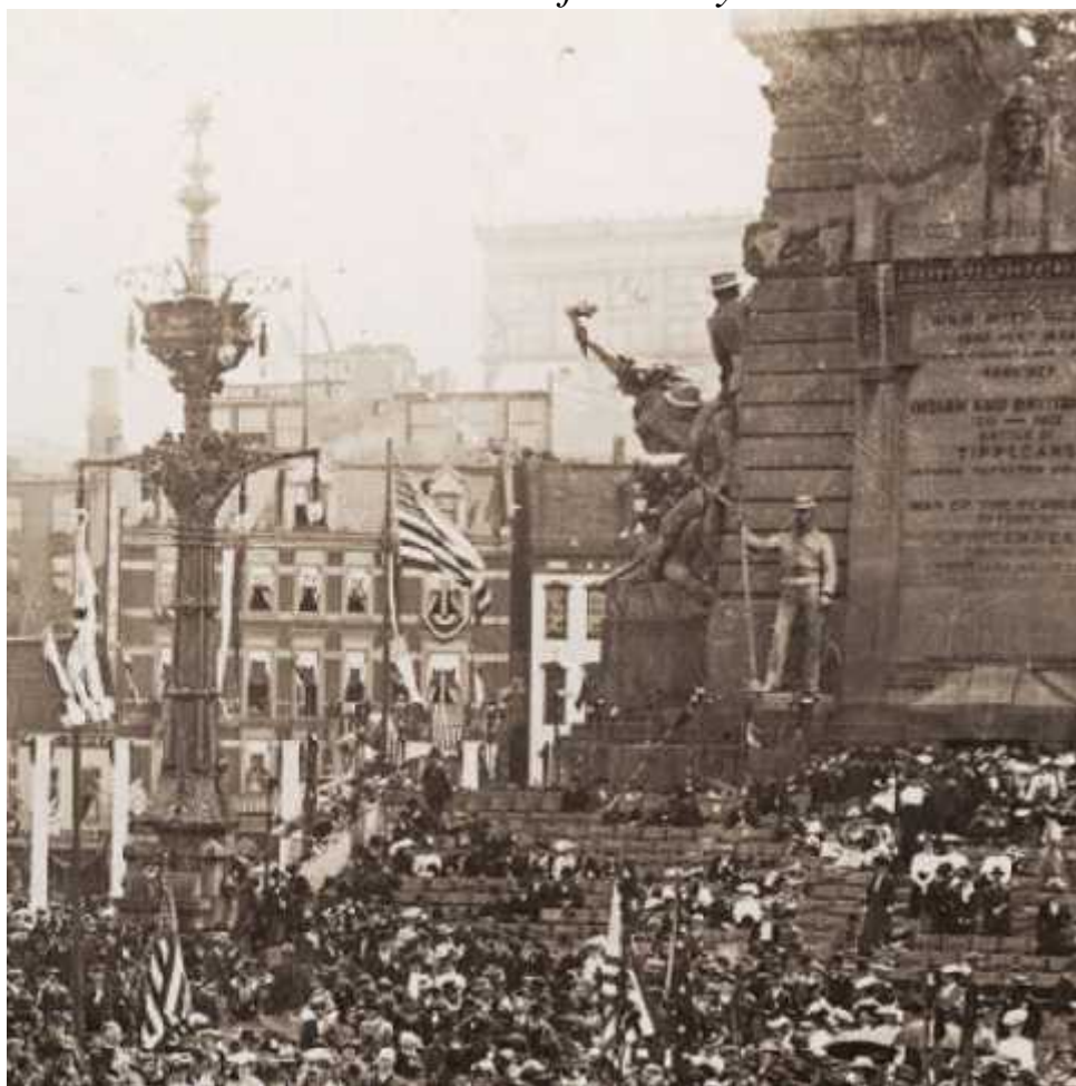
Dedication of the Soldiers' and Sailors' Monument, 1902.