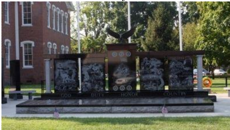
Photo and information from http://www.hmdb.org/marker.asp?marker=22525

Scott County War Memorial is dedicated to all Scott County veterans who served during war and conflict. It is located on the northwest lawn of the Scott County Courthouse in Scottsburg.