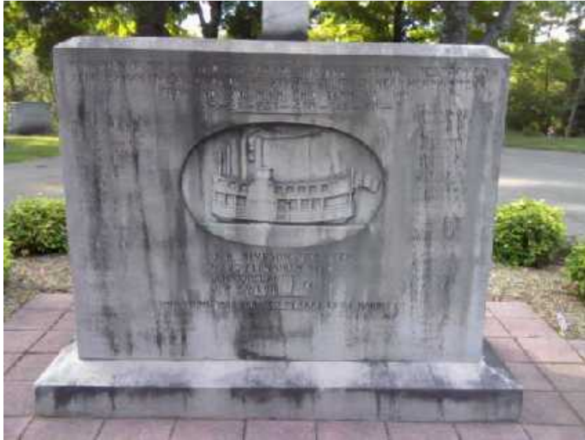
Image and information from “S.S. Sultana Memorial.” Accessed April 25, 2016. http://www.atlasobscura.com/places/s-s-sultana-memorial Information from “The Sultana Descendants’ Association.” Accessed April 25, 2016. http://thesultanadisaster.com/the-sultana-descendants-association/