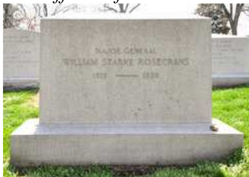
Some information from "General Rosecrans Memorial." Kingston Township, Delaware County, Ohio. Accessed 27 April 2015.

http://www.kingstontwp.org/Rosecrans.htm .