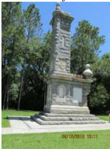
Thompson Photo Album