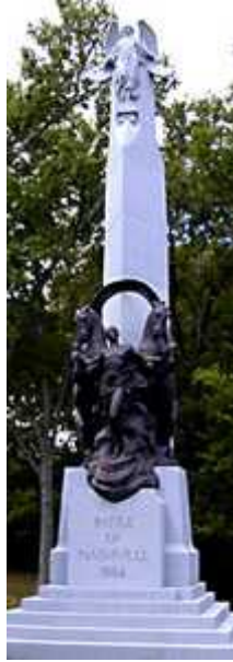
Photo and information from: http://www.bonps.org/tour/nashmon.htm .