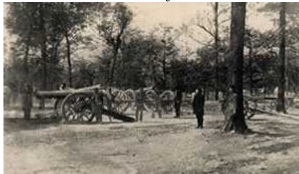
Union Siege Guns on Grant's Last Line

Shiloh National Military Park and the Corinth Civil War Interpretive Center have excellent films and displays to show visitors about the siege, battle and occupation of this key railroad junction. They hold a living history demonstration each year to commemorate the Battle of Shiloh anniversary. The park is open every day from dawn to dusk and the park visitor center and Corinth are open from 8-5 daily. Both locations are closed on Christmas Day. There is no charge to visit.