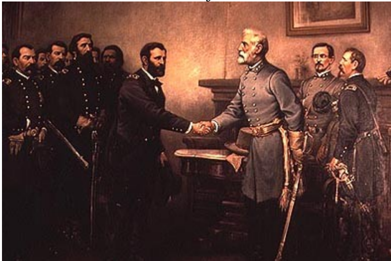
Peace in Union by Thomas Nast, this original oil painting hangs in the War Room Exhibit Gallery.