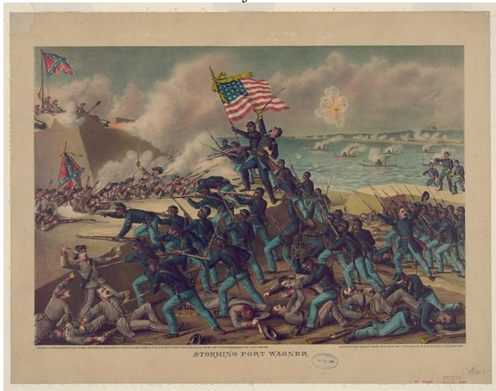
“Storming Fort Wagner,”

Two of Frederick Douglass’ sons fought in the 54 th Massachusetts (made famous in the movie Glory ). Both Charles and Frederick Douglass Jr. survived the Civil War, and lived to see their father hang a picture of the 54 th storming Fort Wagner in his front hallway at his Cedar Hill home in Washington D.C.