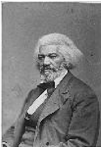
National Park Service

Frederick Douglass and the African American Participation in the Civil War