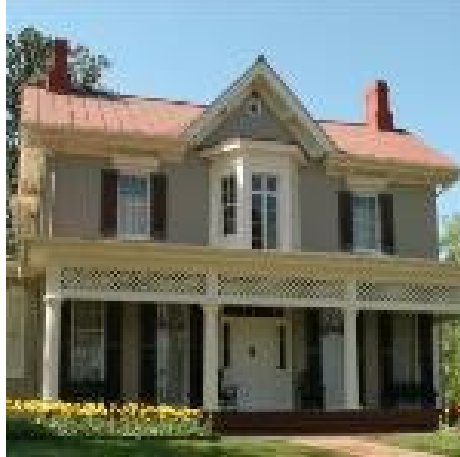
National Park Service

Cedar Hill, Frederick Douglass National Historic Site , 1411 W. Street SE, District of Columbia: The site is open every day of the year with the exceptions of Thanksgiving, December 25, and January 1 st . Summer hours (April 15-October 14) are from 9 a.m. to 5 p.m. Winter hours (October 15-April 14) are from 9 a.m. to 4 p.m. Access to the house is by ticketed tour only. There are a limited number of tickets available for each hour. Tour tickets are available by reservation or on a first-come, first-served walk-in basis. Reservations are encouraged. Ranger led tours last approximately 30 minutes. Visitors are encouraged to arrive at least 20 minutes early to pick up tickets at the Visitor Center and use restrooms.