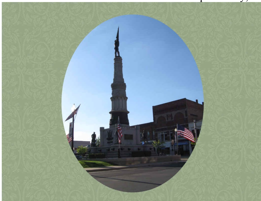
Randolph County Indiana Historical Society

Four Civil War Personalities of Note from Randolph County, Indiana