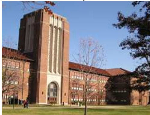
Photo and information from http://www.nps.gov/nr/travel/indianapolis/arsenaltech.htm and The Story of Technical High School (found on the school’s IPS website)

In 1861, Governor Oliver P. Morton established a State Arsenal in Indianapolis, which supplied munitions to Indiana regiments and the National Government. On July 11, 1862, Congress passed an act purchasing land and establishing “a permanent National Arsenal at Indianapolis for the deposit and repair of arms and munitions of war.” The Indiana Arsenal was closed April 8, 1864, and the National Government built the main Arsenal in 1865. They also built a residence, shops, and a powder magazine. By 1893, they added a barn, another residence, guard house, gateway and a work shop. Fifty soldiers maintained the site and thirteen officers have commanded the Arsenal over the years. The Arsenal was abandoned in 1903. Winona Technical College owned and used the property from 1904 to 1910. Indianapolis Public School opened Arsenal Technical High School on the grounds in 1912. Many of the original buildings still remain.