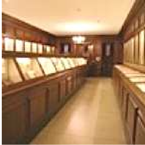
Photo of gallery room and information

Theodore Roosevelt Birthplace National Historic Site is located at 28 E. 20 th Street, New York City. It is open Tuesday – Saturday, 9-5 p.m. and is closed on the following federal holidays (New Year’s Day, Independence Day, Thanksgiving Day, and Christmas Day). The period rooms can only be seen by guided tours, which available on the hour at 10, 11, 1, 2, 3 and 4. There is no tour at noon. Tours are limited to 15 people and last approximately 30 minutes. Groups of 10 or more must make reservations for a group tour at least two weeks in advance, by calling (212) 260-1616. Visitors can also visit the ground floor gallery which contains hundreds of items from Roosevelt’s life.