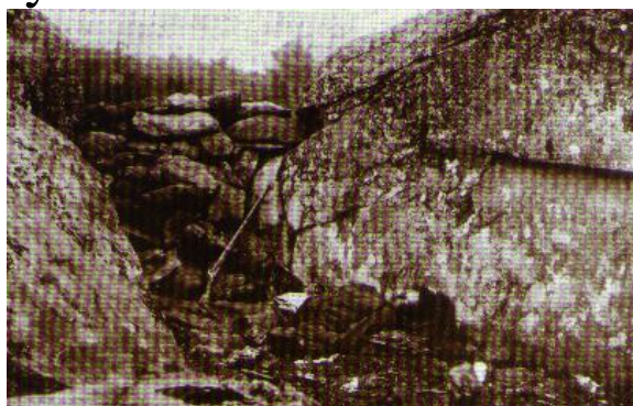
This Confederate sniper was probably killed by Union batteries, July 2, 1863. (Gettysburg postcard)

The fury of battle raged around the Devil's Den and Round Tops July 2, 1863 as Law's Alabama Brigade attempted to wrest the now famous landmarks from Federal hands. When he entered the battle, Evander McIver Law, age twenty-six, was one of Robert E. Lee's most promising generals. His brigade of Alabamians shared the Army of Northern Virginia's sense of invincibility. After a grueling twenty-five mile march to the battlefield, Law's men made a valiant three-hour effort to gain control of the high ground that is the now famous Round Tops. Two days after it arrived, the brigade retired from the field with the realization that the Federals had matched their own fighting ability. Law himself departed with the seeds of discord planted that would ultimately culminate in a devastating feud between himself and Longstreet.